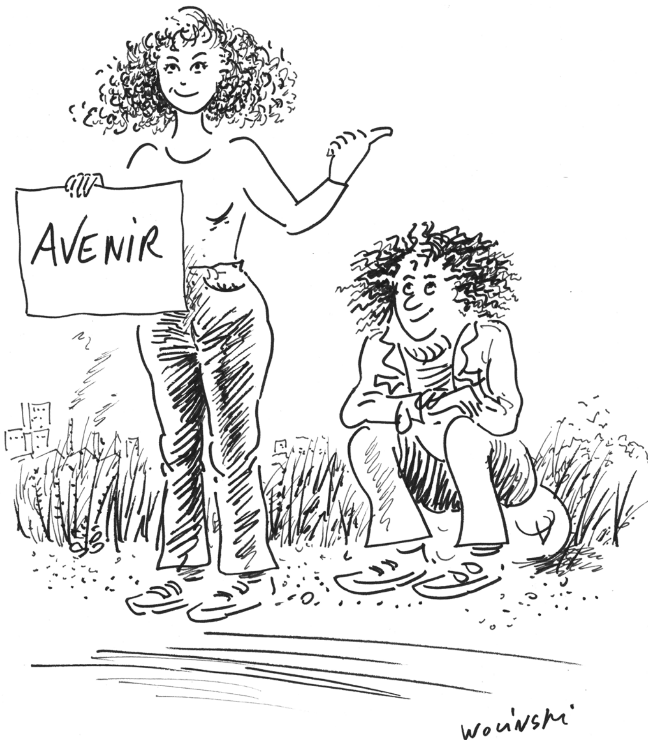
© Georges Wolinski Avenir (Future), 1969 China ink on paper / 34,5 x 25,5 cm