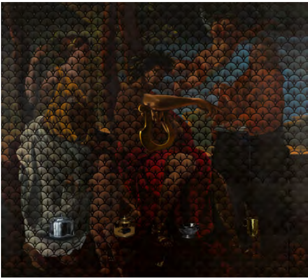
Olivier Masmonteil L'inspiration du poète, 2018 Oil on canvas, 180 x 200 cm