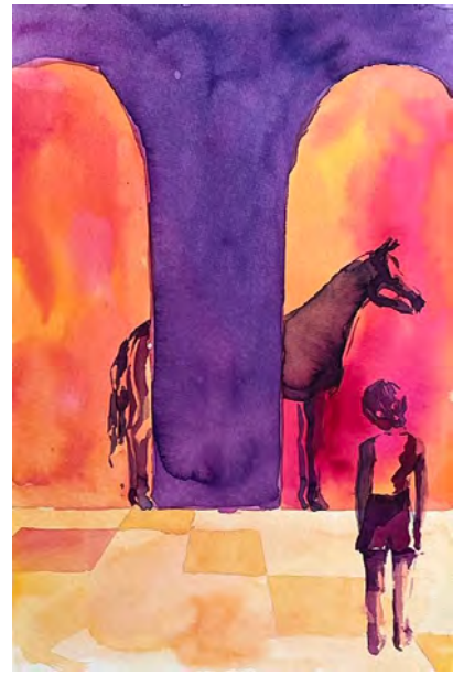
Agathe Chebassier Triptyque Fantôme et fantômes, 2023 (détail) Ink on paper mounted on canvas / 89 x 63 cm