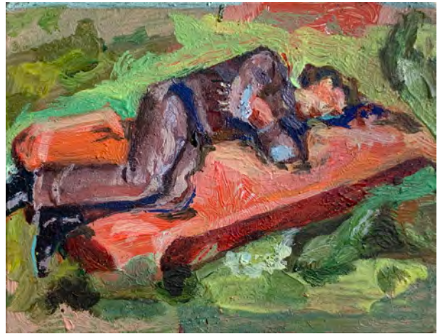
Léa Toutain Aloof II, 2023 Oil on metal / 4,5 x 7 cm