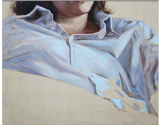
Lara Bloy Les égarés VII, fragment, 2022 Oil on canvas / 46 x 45 cm