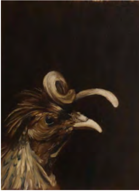
Marguerite Hollemaert Poule à cornes, 2022 Oil and acrylin on canvas / 40 x 30 cm