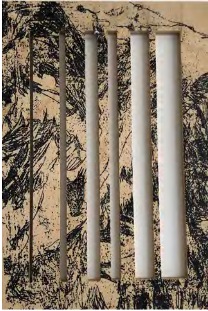
Charlotte Cuny Combine 1, 2021 UV print on wood / 33 x 45 cm