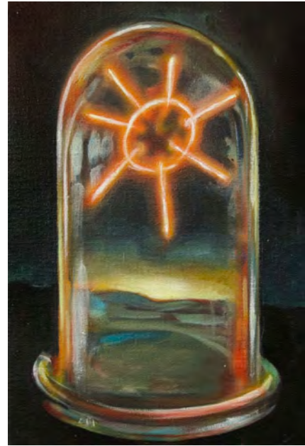
Nicolas Marciano Soleil sous globe, 2022 Oil on canvas / 22 x 16 cm