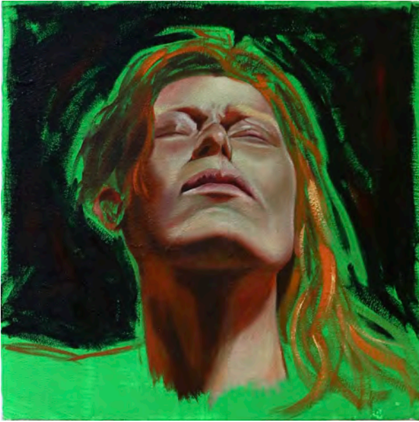
Alexandre Lichtblau Maud, 2023 Oil and acrylic on canvas / 30 x 30 cm