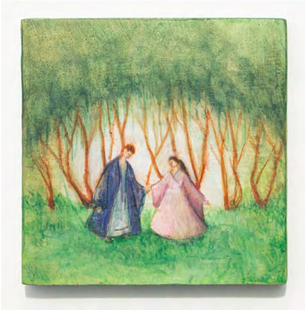
Gladys Bonnet La clairière, 2023 Oil on wood / 7 x 7 cm