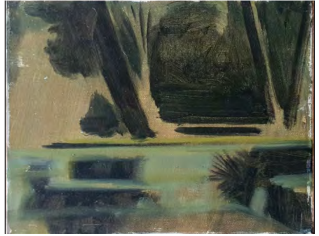
Yann Lacroix Flamingo, 2018 Oil on canvas / 27 x 35 cm