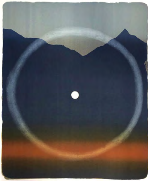
Diane Benoit du Rey Mirage, 2021 Lithography / 55 x 75 cm