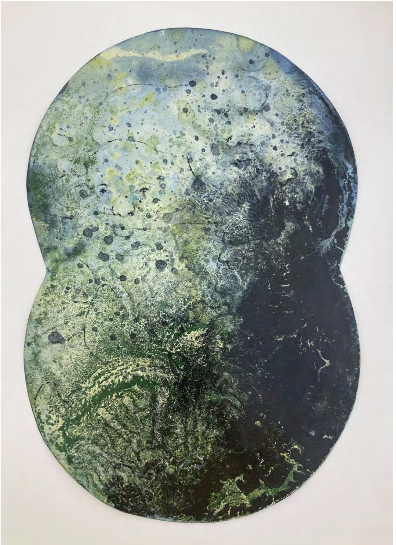
© Dan Barichasse. Double tondo (2013), painting on glossy paper, 45 × 30 cm