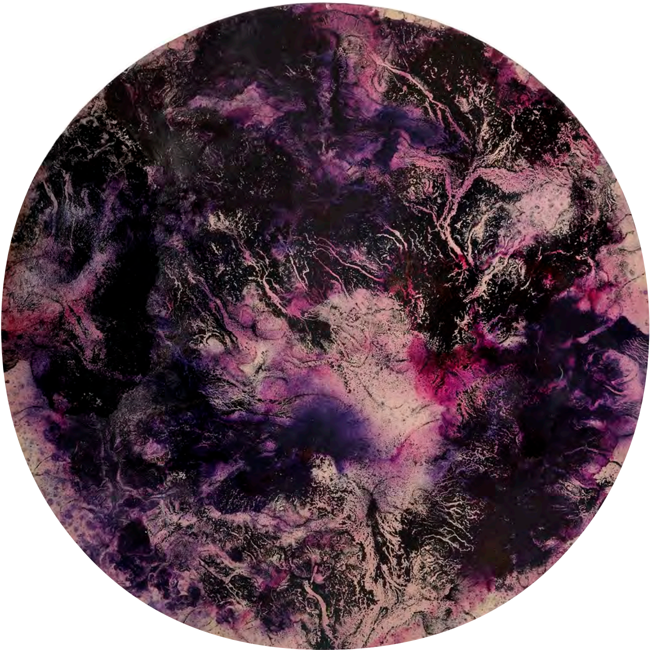
© Dan Barichasse. Tondo (2023), painting on paper mounted on honeycomb cardboard, dia. 122 cm