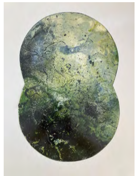
© Dan Barichasse. Tondos (2023), paintings on paper mounted on honeycomb cardboard, dia. 122 cm